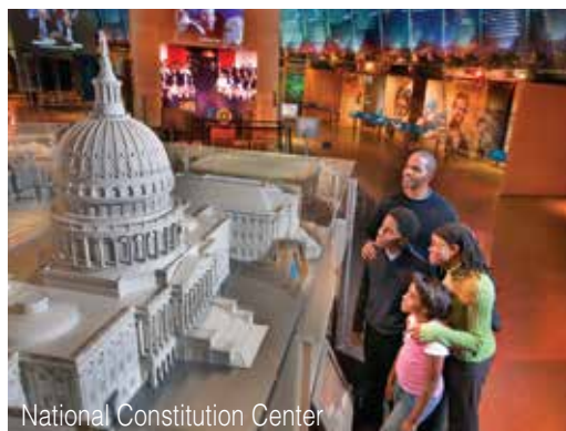
National Constitution Center

Museum of the American Revolution, National Constitution Center