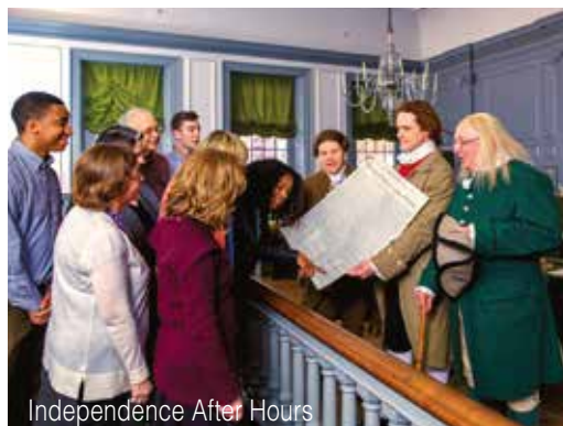
Independence After Hours

Independence After Hours, Tippler's Tour