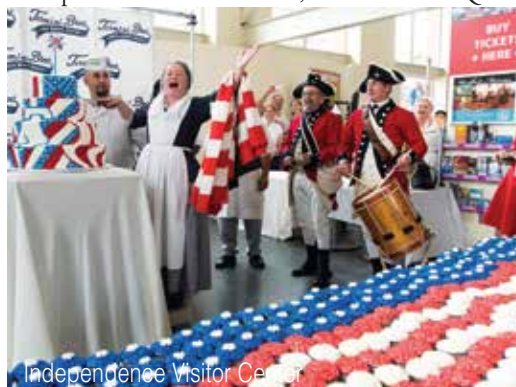
Independence Visitor Center

Once Upon A Nation Storytelling Benches, Independence Visitor Center, Colonial Kids' Quest